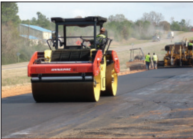
Dynapac asphalt rollers and pavers